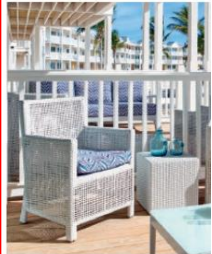
Clockwise from top: Pier at Cheeca Lodge & Spa; Bogie & Bacall's restaurant at Bungalows Key Largo; terrace at Isla Bella Beach Resort; guest room at Cheeca Lodge