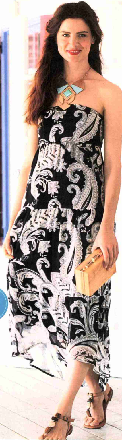
Hair and makeup by Cherie Combs with Creative Management @ MC2.

OUT TO EAT Try the signature conch fritters at Morada Bay Beach Café (seen here), overlooking the Florida Bay.